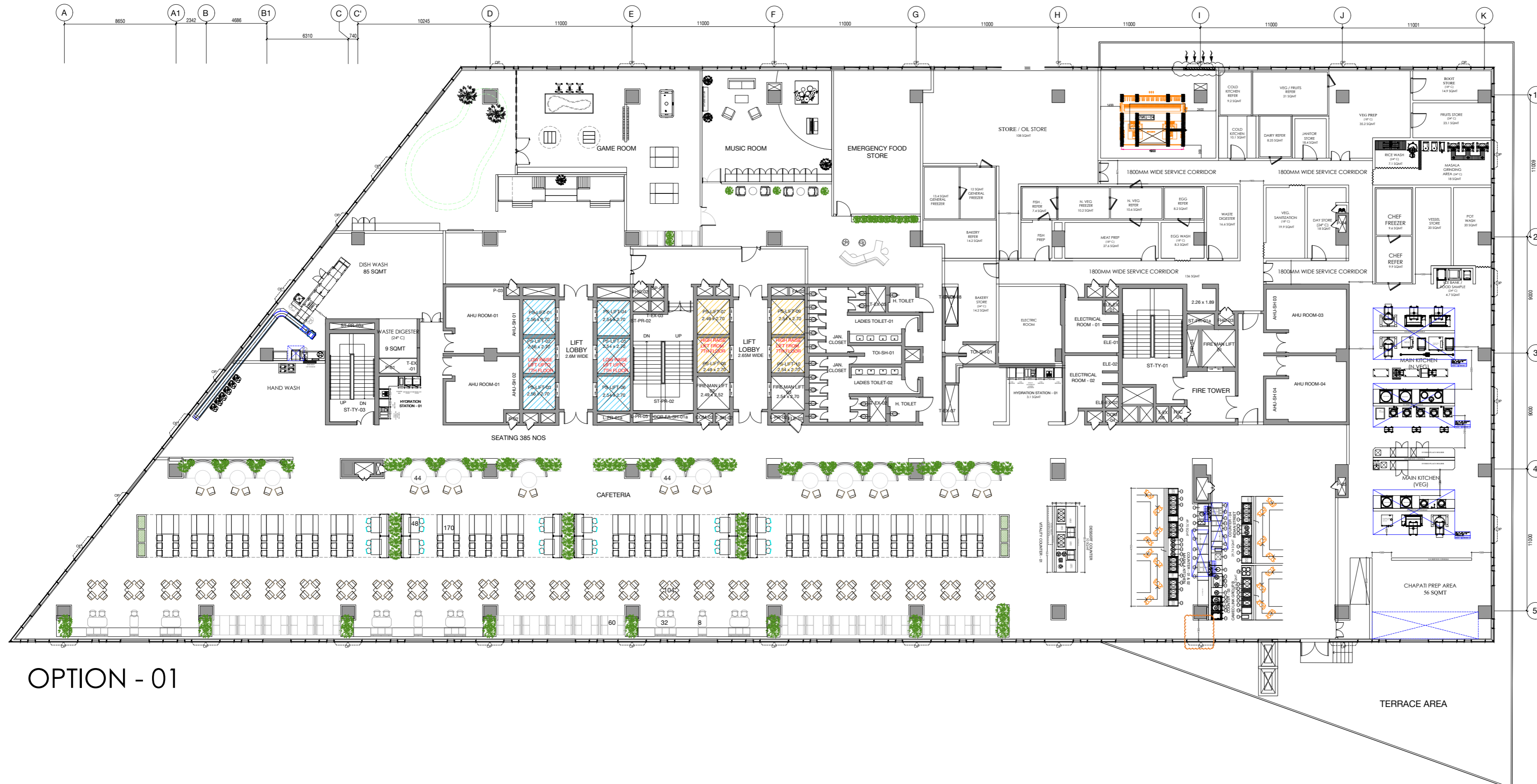
OPTION - 01